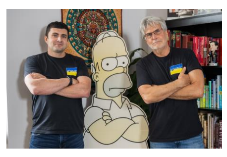
Berlin still jokes that Homer Simpson is the chairman of LP

Logistics Plus, Inc. 1406 Peach Street Erie, PA 16501 Toll-Free: 866.564.7587 Phone: 814.461.7600 mbausa@logisticsplus.com mbausa.org/logistics logisticsplus.com