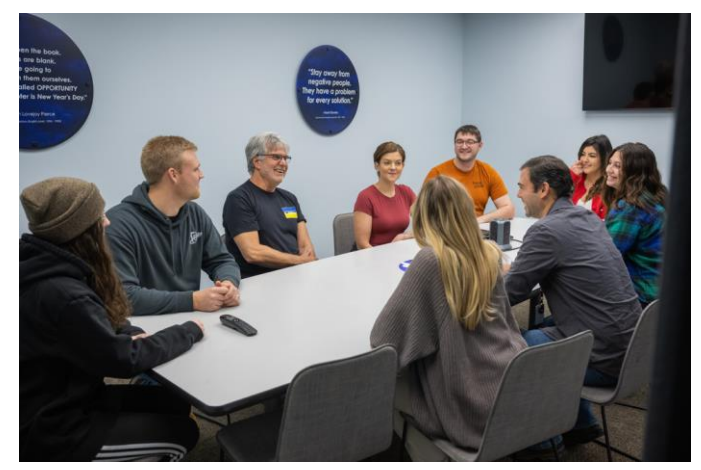
Logistics Plus continues to expand its operations in Erie and around the world. The company now has over 8 million square feet of global warehousing.

In addition to its growth and expansion in Erie and the United States, Logistics Plus has been actively building out its global footprint and capabilities. Logistics Plus has been a strong advocate for support and rebuilding efforts in Ukraine since the war began.